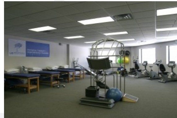
3671 Southwestern Boulevard Suite 207 Orchard Park, New York