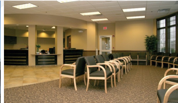
4949 Harlem Road Amherst, New York